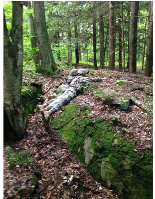
Field phase of NCO School