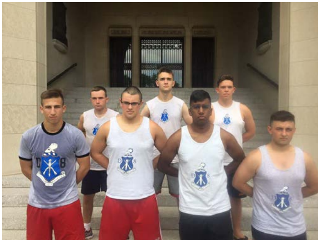
Recent graduates of NCO School after the 12 Mile Run

Congratulations to the latest class of NCOs who graduated from NCO School earlier this month!